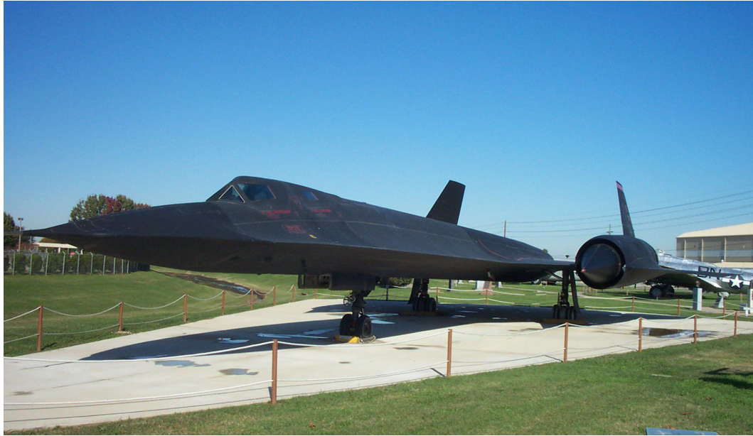
SR-71 Blackbird. This bird was on static display at Barksdale AFB, LA.